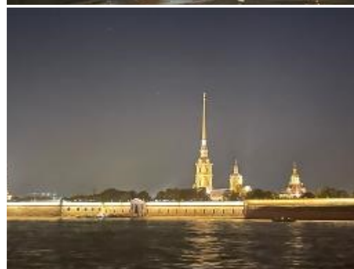
St. Petersburg at night

And we had another trip to Moscow ahead of us! It's a pity that the holidays come to the end.