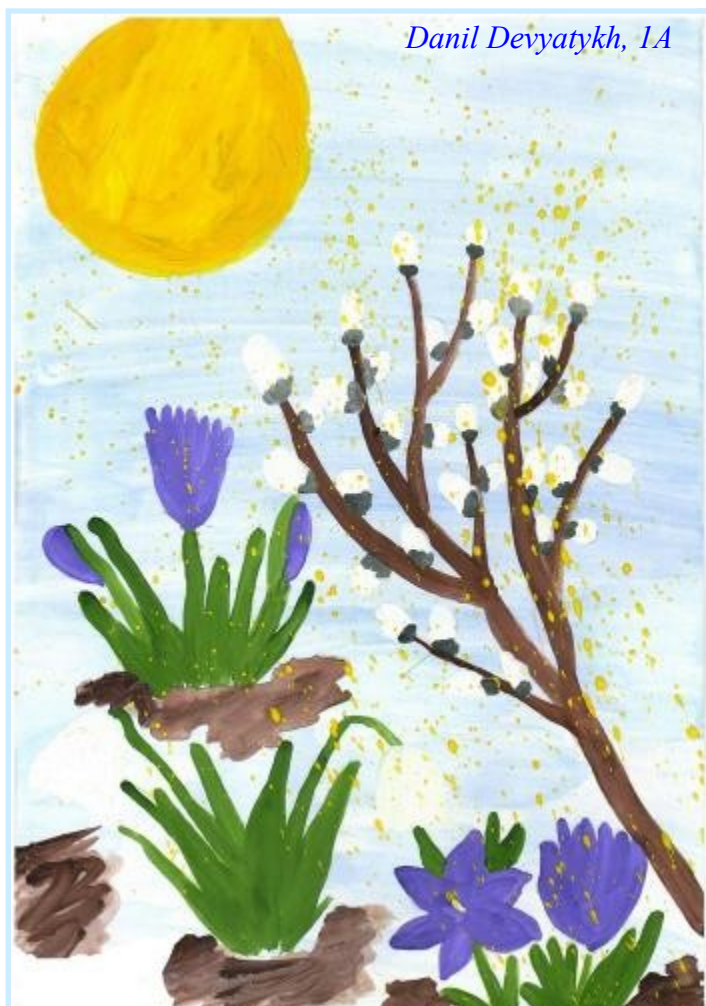
Danil Devyatykh, 14