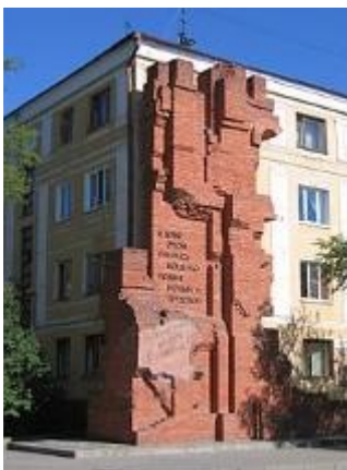
Pavlov's House in 2006

«Only the people that honors its heroes can be considered great» Konstantin Rokossovsky