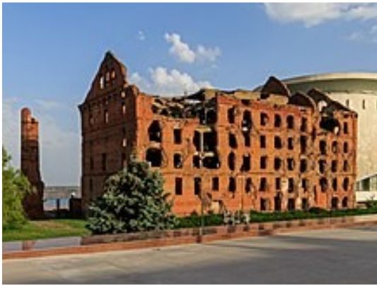
The ruins of the mill as they appear today