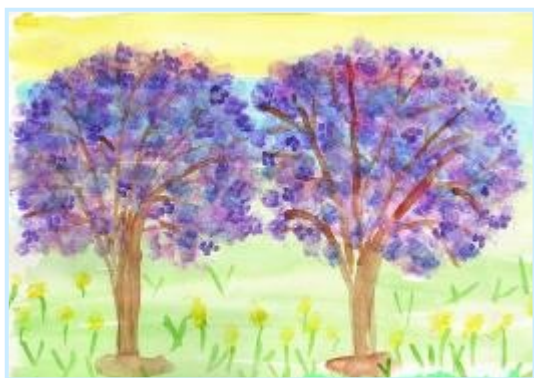
Platon Bezukladnikov, 1G