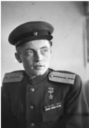
Yakov Pavlov in 1947