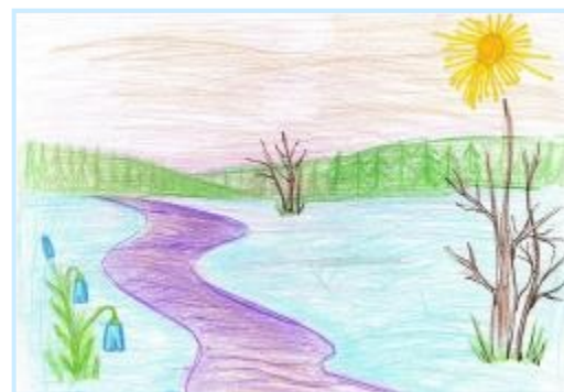
Maxim Starodub, 1G