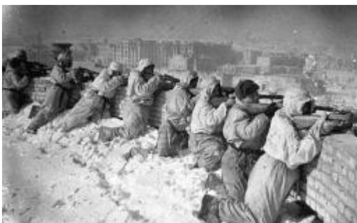
Soviets defend a position