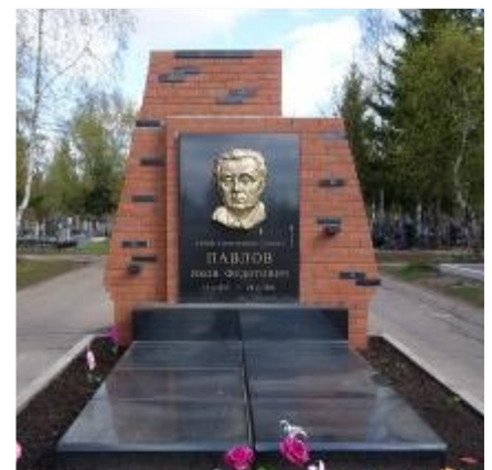
Pavlov's grave in Veliky Novgorod