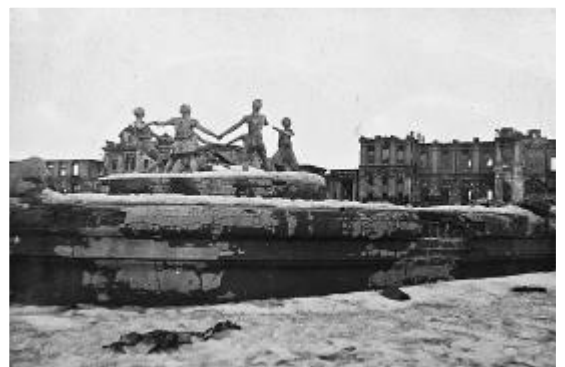
The centre of Stalingrad after the battle

Gerhardt's Mill is a building of historical significance in the Battle of Stalingrad. Gerhardt's Mill is situated directly across from Pavlov's House in central (modern-day) Volgograd. It is preserved in its bombed-out state and is one of the main landmarks of the Battle of Stalingrad. The mill provided a vital role in the Defense of Stalingrad.