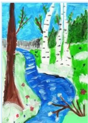
Yaroslava Tsyutskaya, 1D