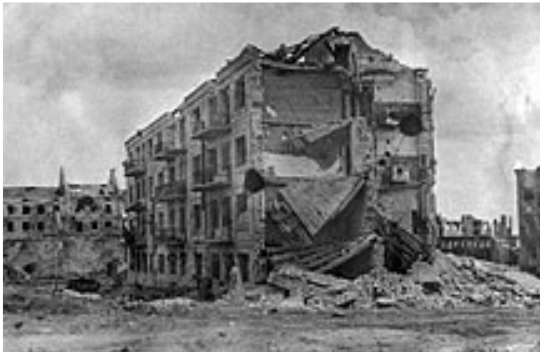
Pavlov's House in 1943. Gergardt Mill in background