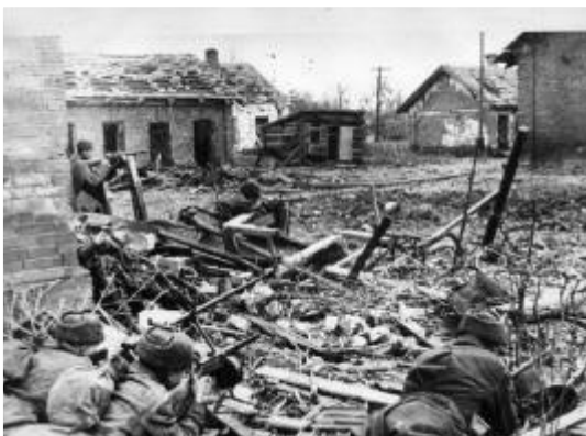
Soviets preparing to ward off a German assault in Stalingrad's suburbs

The Day of the defeat of the German fascist troops by Soviet troops in the Battle of Stalingrad (1943)