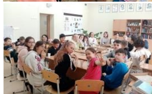
My beloved seventh graders