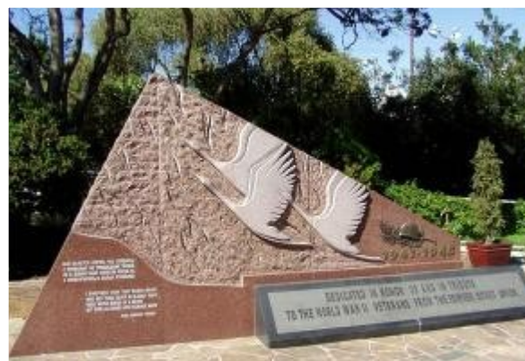
The Monument to “White Cranes” in Los Angeles, USA (was opened on May 9, 2005)

The poem was originally written in Avar language, with many versions surrounding the initial wording. Its famous Russian translation was soon made by a Russian poet and translator Naum Grebnyov, and was turned into a song in 1969, becoming one of the best known Russian-language WWII ballads all over the world.