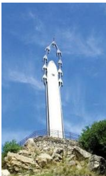
The first monument to “White Cranes” in Gunib, Dagestan (was opened in 1985)

"It seems to me sometimes that our soldiers Who were not to return from fields of gore Did not one day lie down into our land But turned into a skein (wedge) of white cranes..."