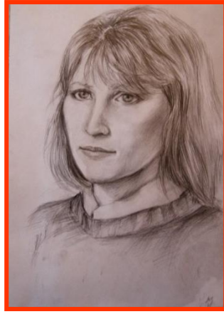
Portrait of my mom