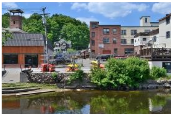
St. Regis Canoe Outfitters on Dorsey St

This business (on the left) is well situated - there are numerous lakes and ponds in the area. In addition, the Northern Forest Canoe Trail passes in front of the store. This marathon water trail runs 740 miles [1191 km] from Old Forge, New York to Fort Kent in the State of Maine. Its passage through Saranac Lake provides a good opportunity for reprovision and rest.