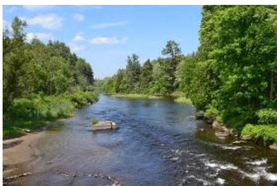
onward to Lake Champlain

This view is downstream from the Pine St bridge. There's a beach on the left bank where you can put your canoe/kayak into or take it out of the river - this avoids the gentle Class I rapids on the right. The Pine St bridge is the last one in Saranac Lake. From here it's about 32 miles [51.5 km] to the Town of Saranac, and 65 miles [104.6 km] to Lake Champlain.