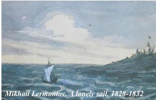
Mikhail Lermontov. A lonely sail, 1828-1832