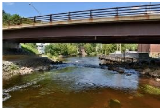
true start of the Saranac River ?

The road crossing the dam is Main Street. It continues into the village's downtown area. The tall building with a clock is the Village Hall. In 1894 the old sawmill at the dam was repurposed to produce electricity: workers installed a pair of generators and two new waterwheels to spin them. Poles were erected and wires strung, and Saranac Lake now had electric lights.