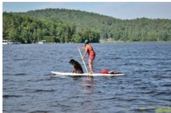
SUP boarding dog on Lake Flower

Lake Flower is a large pond created by the 1827 dam. It's named after Roswell P. Flower, the 30th Governor of New York, and not a type of plant! The Saranac Lake Winter Carnival's Ice Palace is built in Prescott Park on the lake's northern shore. It's constructed using thick blocks of ice cut from Pontiac Bay, an adjoining part of the lake that sits away from the river's current.