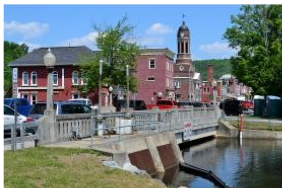
Lake Flower dam

The road crossing the dam is Main Street. It continues into the village's downtown area. The tall building with a clock is the Village Hall. In 1894 the old sawmill at the dam was repurposed to produce electricity: workers installed a pair of generators and two new waterwheels to spin them. Poles were erected and wires strung, and Saranac Lake now had electric lights.