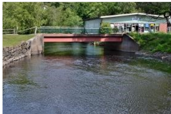
Woodruff Street bridge

This bridge is in the center of downtown Saranac Lake. It was built in 1922 and is the oldest of the current village bridges. The blue building on the right is the former Dew Drop Inn. As you can imagine, it's subject to minor flooding when the river level rises. This scene illustrates why paddling a canoe through Saranac Lake is a unique photogenic experience.