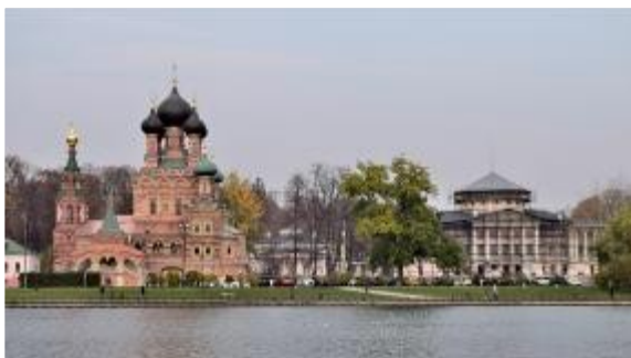
Church of the Holy Trinity in Ostankino