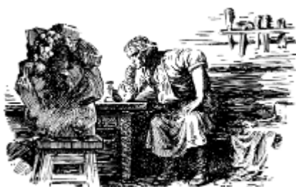
THE FLOWER OF STONE

I t wasn't only Mramor that was famous for stone carving, folks say there were craftsmen in our villages too. Only ours mostly worked with malachite, because there was plenty of it, and the very finest kind. The things they made, you'd just stare and wonder how they did it.