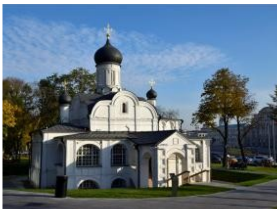
Church of the Conception of St Anne in the Corner

Moscow is a very big city. Its people practice many different religions, but almost all of its places of worship are Russian Orthodox. Wikipedia says there are 711 Russian Orthodox churches and chapels in Moscow. I photographed a number of them last October and am presenting a half dozen here. I selected churches that you may not have seen before - most people have seen pictures of St Basil's Cathedral!