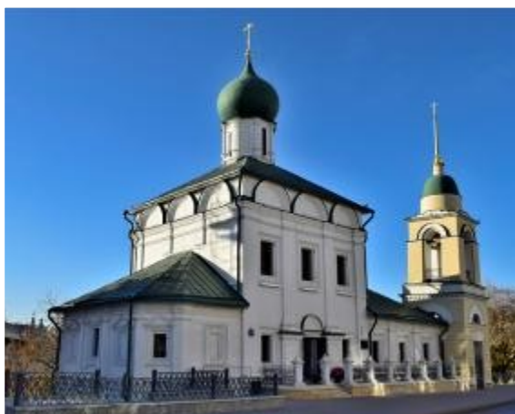
Church of St Maximus the Blessed on Varvarka

Saint Anne was the mother of Mary and the grandmother of Jesus. Her church is on the eastern edge of Zaryadye Park near the Moskva River. Its full name ends with "in the Corner" because it was located in the southeast corner of the old fortification wall. That wall surrounded the Kremlin and Kitay-Gorod. St Anne's is one of the oldest churches in Moscow, and was first mentioned in writing when it burned to the ground in 1493. The stone church was built in the middle of the 16th century. The building was restored in the 1950s.