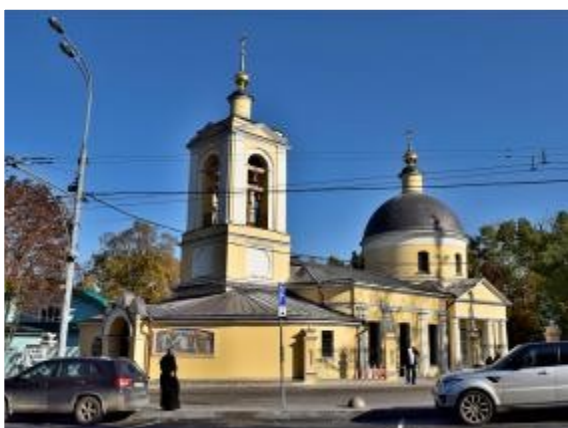
Church of the Holy Trinity on Sparrow Hills

The Church of the Holy Trinity is located on 1st Ostankinskaya St. It's next to Ostankino Palace and across the street from Ostankino Pond. A country estate, including the original Holy Trinity Church, was built at this location in 1584. However, the buildings were destroyed during the Time of Troubles (1598-1613). The current brick and stone church was built between 1677 and 1692. Ostankino Palace was built between 1790 and 1798. Today the City of Moscow operates the Ostankino Museum-Estate, which the church complements but is not part of.